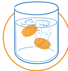
EFFERVESCENT (Tablets & Granules)